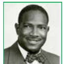
Andrew Jackson Foster

Among the notable figures is Andrew Jackson Foster , who was the first Black Deaf person to graduate from Gallaudet University , earning his bachelor's degree in 1954. Known as the "Father of Deaf Education in Africa," he overcame segregation to establish 32 schools for the deaf across 13 African countries.